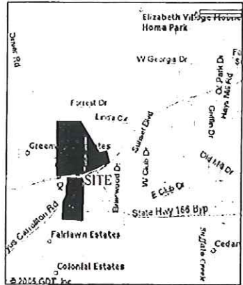
LOCATION MAP CITY OF CARROLLTON SCALE: 1" = 2100'

CITY ENGINEER'S CERTIFICATION I HEREBY CERTIFY THAT THIS PLAT IS OFFICIALLY APPROVED FOR RECORDING IN THE OFFICE OF THE CLERK OF THE SUPERIOR COURT, CARROLL COUNTY, GEORGIA. BY: [Signature] DATE: 8/19/11